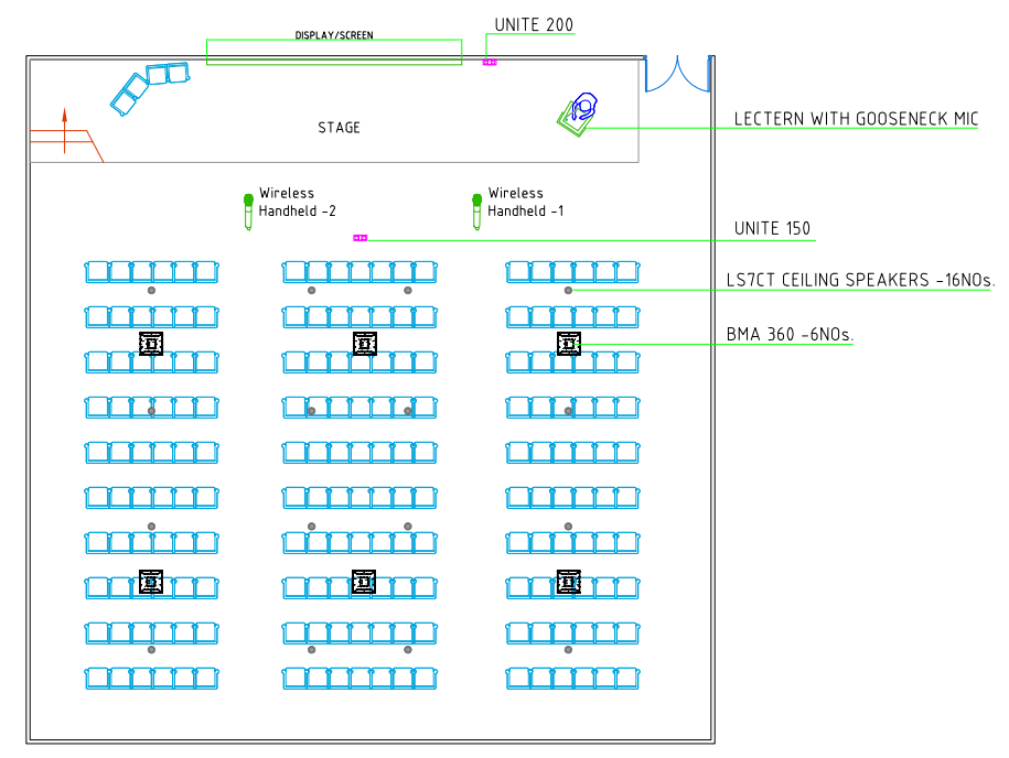
LARGE LECTURE HALL